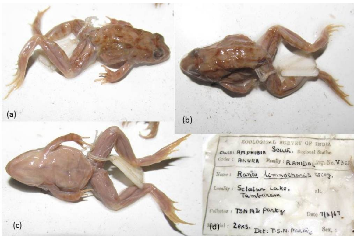
Figure 1. Neotype of Fejervarya agricola ZSI/SRS/V/A/362 – (a) lateral view, (b) dorsal view, (c) ventral view, (d) original jar label.