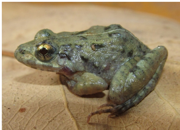
Figure 2. A live uncollected toptotypical individual of Fejervarya agricola from Madras.

Colouration in life (based on live uncollected individuals): Dorsum dark olive green to dirty brown, with distinct yellow marblings on the many warts; a yellowish white vertebral stripe from prefrontal to groin present or absent; limbs often barred with darker shade; venter and lateral regions, especially along lower lips, mid trunk, thigh and lower hindlimbs white; infralabials dotted with intermediate dark olivaceous spots, gular sac in males grey to black; the region below thighs distinctly flesh coloured, dotted with whitish warts; underside of limbs dirty brown to flesh coloured; iris fawn brown, with a black rhomboid pupil bilaterally edged by black wash (Fig. 2).